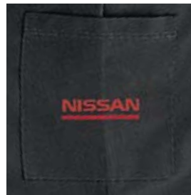
NP PDA / Utility Pocket (for pants) utilizing Nissan Wordmark with Accent Line

*Use this extension when ordering the Black pant only.