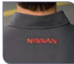
Tech shirt is stocked with both left arm and back logo embroidery.