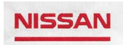
N6 Nissan Wordmark with Accent Line