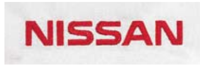
N4 Nissan Wordmark Logo