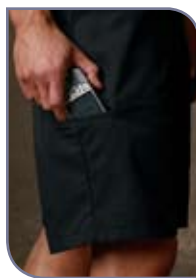
Side cell phone pockets allows you to work and sit comfortably.